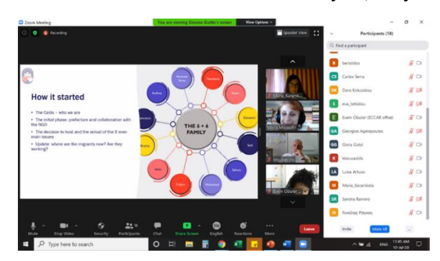
1st Online Bi-lateral Session, July 10th, 2020 MDAT & Municipality of Padova (with Technical Partners)

Since the start of the EMRACIN Project, Major Development Agency Thessaloniki (MDAT) &